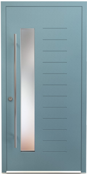
Colour: SEN028 Oakham DM0015