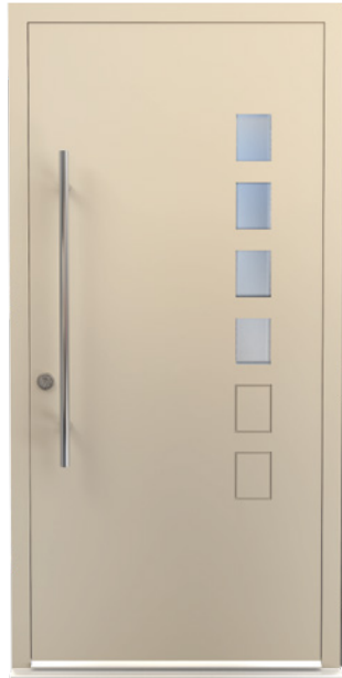
Colour: CWD004 Mayfair DM0017