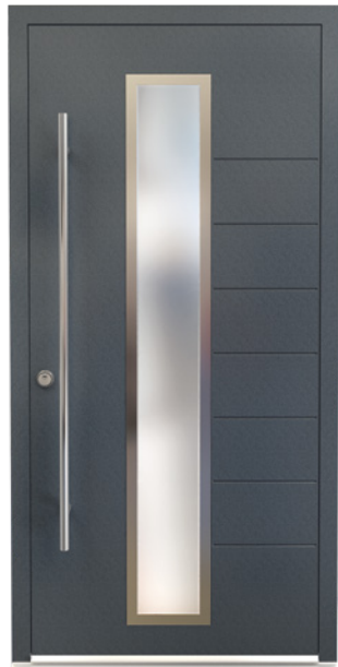
Colour: SEN015 Kensington DM0012