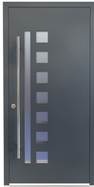
Colour: SEN015 Kingsbridge DM0011