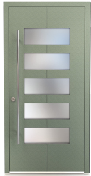
Colour: SEN018 Pembroke DM0016