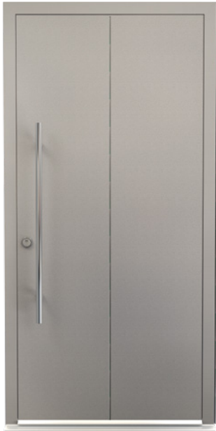
Colour: SEN025 Canonbury DM0005