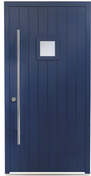
Colour: CTN001 Churchill DT0010