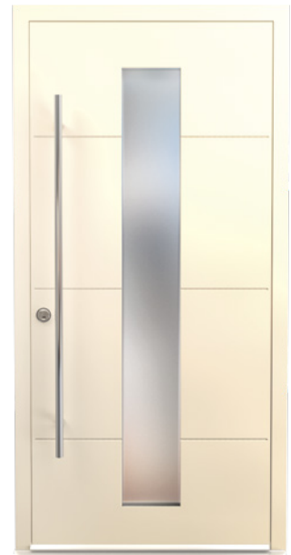
Colour: CWD002 Amersham DM0001