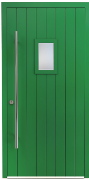
Colour: CTN003 Purton DT0011