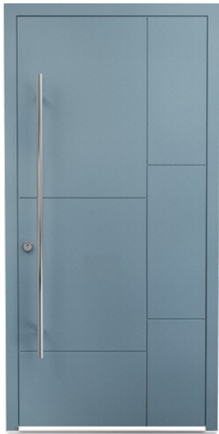
Colour: SEN028 Teddington DM0024