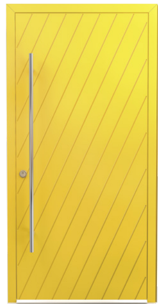
Colour: CTN006 Axbridge DT0009