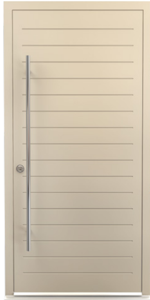
Colour: CWD004 Eastleigh DM0007