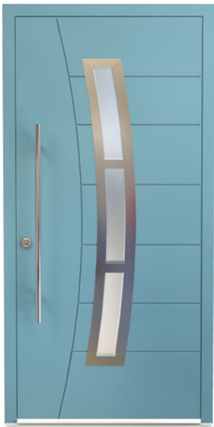
Colour: SEN028 Marlborough DM0014