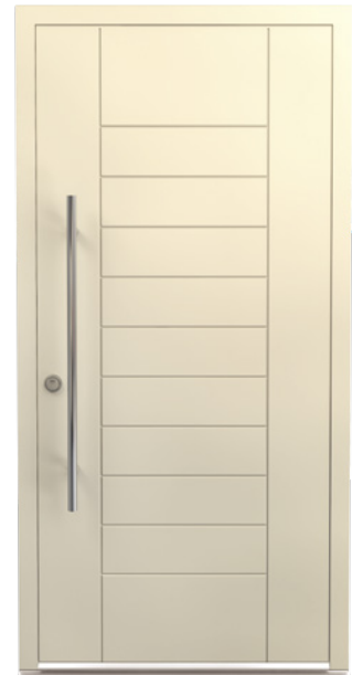
Colour: CWD002 Bloomsbury DM0003