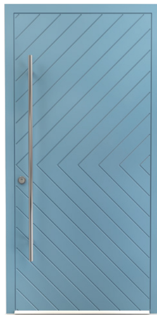
Colour: CTN002 Somerton DT0012