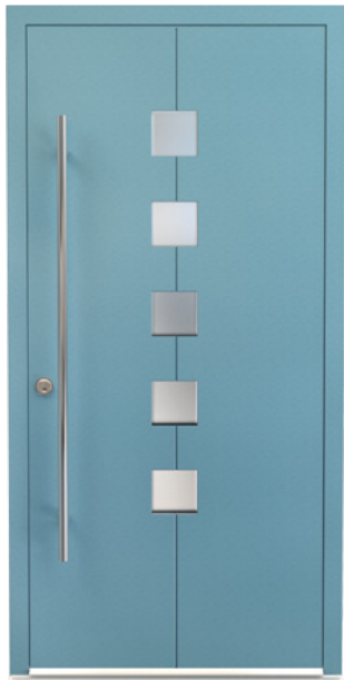
Colour: SEN028 Falmouth DM0008