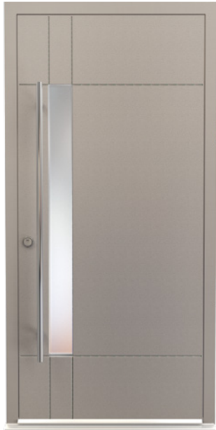
Colour: SEN026 Clifton DM0006