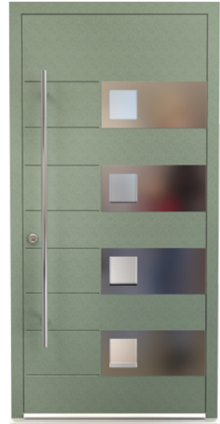
Colour: SEN018 Highgate DM0010