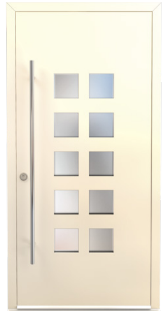
Colour: CWD002 Purbeck DM0018