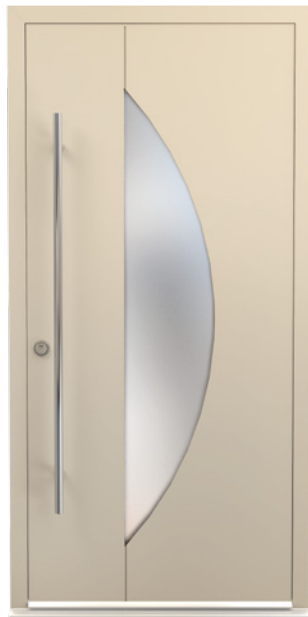
Colour: CWD004 Richmond DM0022