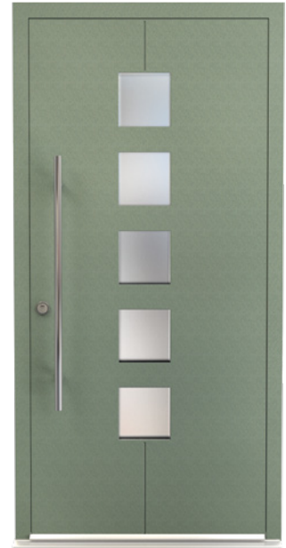
Colour: SEN018 Lymington DM0013