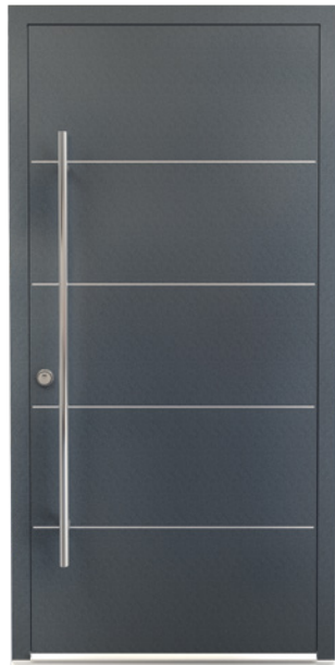
Colour: SEN015 Oxford DM0031