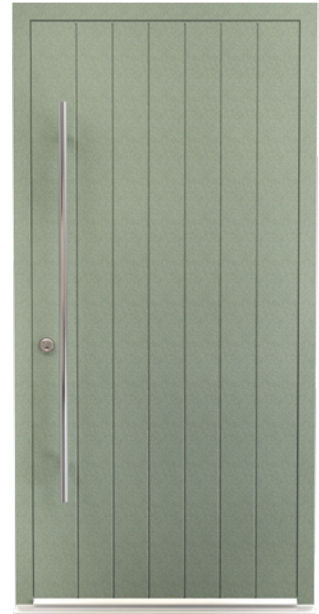
Colour: SEN018 Hambleton DM0009