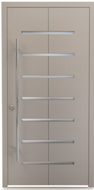
Colour: SEN026 Rushcliffe DM0019