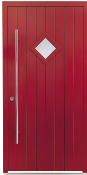
Colour: CTN005 Coleford DT0008

Whether it's a replacement for an existing door or a new build project, you can tailor the door to meet your exact aesthetic, security and performance requirements.