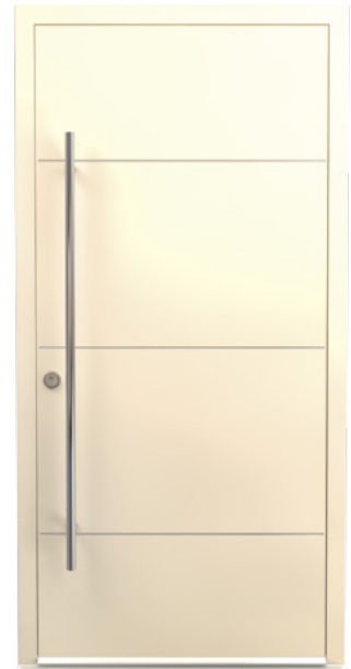
Colour: CWD002 Sherbourne DM0021