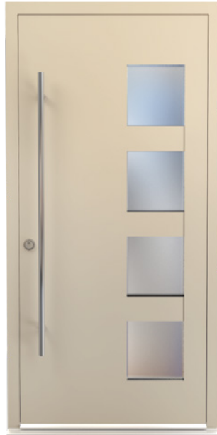
Colour: CWD004 Shipston DM0023