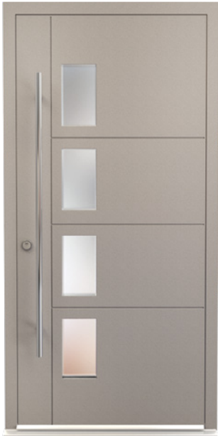
Colour: SEN026 Broadstone DM0004