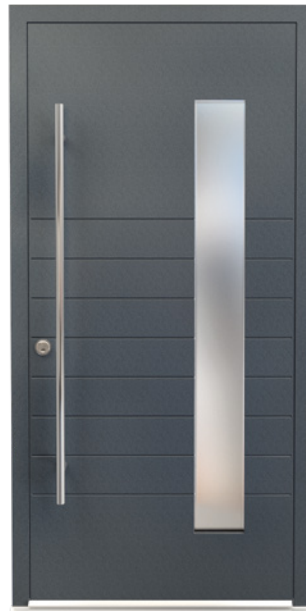
Colour: SEN015 Ashwell DM0002